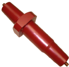
Shielded Through Bushing See Polycast Catalogue Sec 6, Pages 170 thru 172