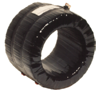
PRCT Window CT See Polycast Catalogue Sec 3, Page 139