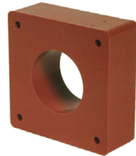
PICW Window CT See Polycast Catalogue Sec 3, Page 131