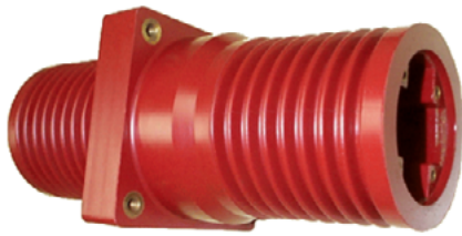
Shielded Wall Bushing See Polycast Catalogue Sec 6, Page 177b

Bushing & Current Transformer Assemblies, 60kV to 170kV BIL